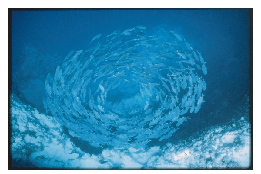
Fig. 1. Fish schools provide an example of emergent pattern such as milling in which individual members circle about an unoccupied core.

Other selection factors also favor aggregation. Mating and mate choice lead to small, ephemeral assemblages (swarms of mosquitoes, leks of sage grouse) as well as large, predictable aggregations (herds, pods, and schools migrating to and from spawning